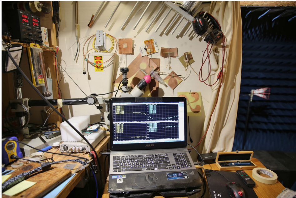
Image #1: S5085 in use beside the Lab Bench station in the CIA Antenna Lab